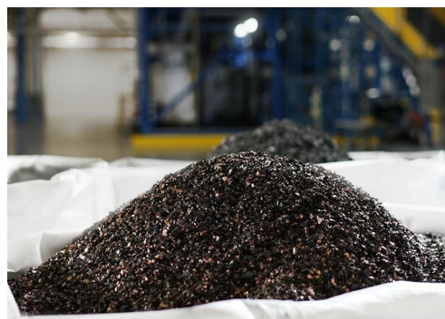
Black mass